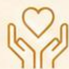
ORF Charity Gala "Nachbar in Not - Hilfe für die Ukraine" Vienna